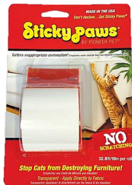
Sticky Paws Double Sided Tape